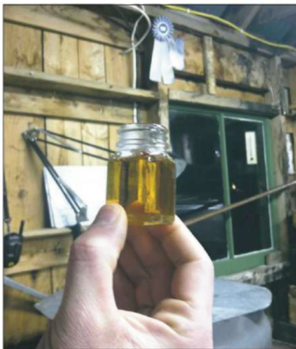
A maple syrup sample is inspected to check for light transparency. The new grading system will be based on flavor variations rather than color, as in the past.

According to the law as stipulated through the Vermont Secretary of Agriculture, Food and Markets, a transition period for using existing grade labeling will extend until January 1, 2015. In addition, producers producing or selling their syrup within the state of Vermont may use the existing grade terminology in addition to the new