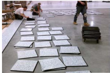
Sustainable flooring made by Mack, SelectTech.

New laws in California tax carpet sales. Money is refunded to companies that find ways to recycle and reuse waste carpet to manufacture other products.